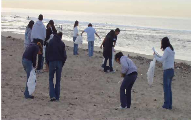
Armed with pencils, checklists, rubber gloves, trash bags and hopes for a healthier planet, these students work to make the beach a cleaner and more enjoyable place for all.

The goal of this event, sponsored in part by ASCE Orange County Branch, is to raise awareness of environmental issues affecting the local and global community. After registering, being separated into small groups and listening to speakers during the opening ceremony, the